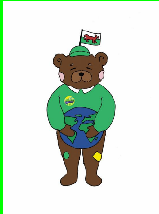
Ethical informed citizens