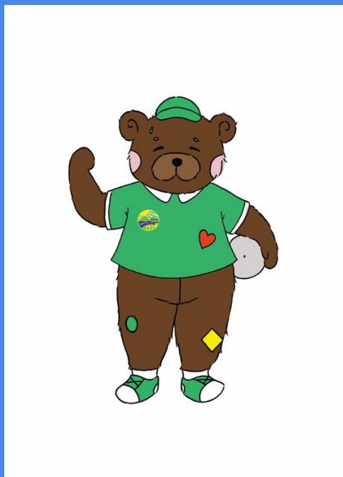
Healthy confident individuals