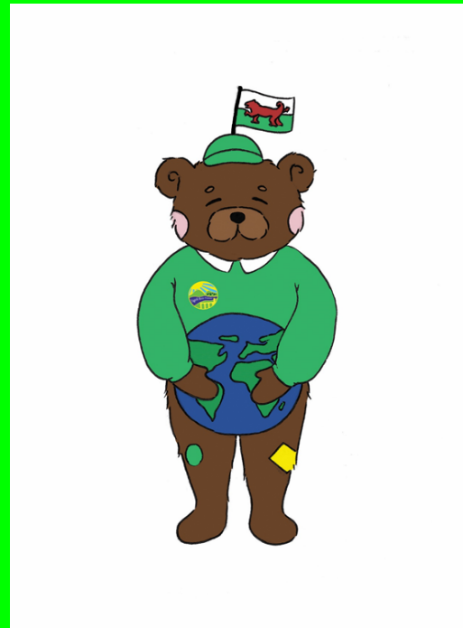
Ethical informed citizens