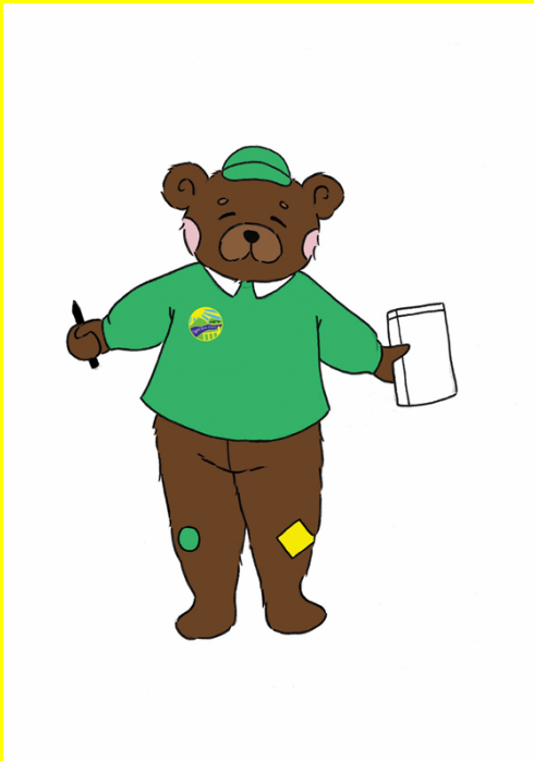
Ambitious capable learners