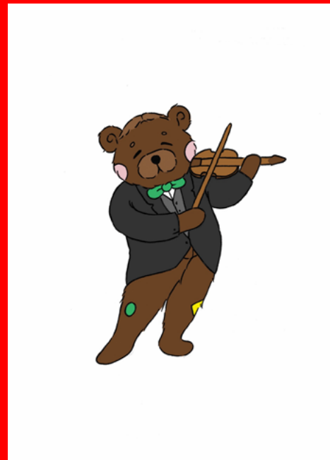
Enterprising creative contributors

These four purposes will be the foundation of everything our children will learn.